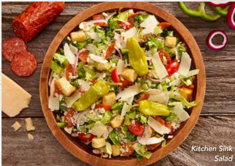
Kitchen Sink Salad