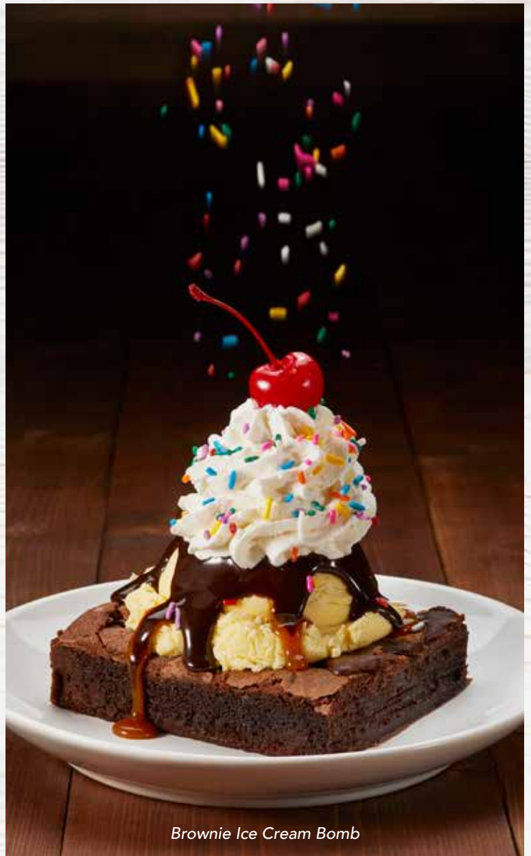
Brownie Ice Cream Bomb