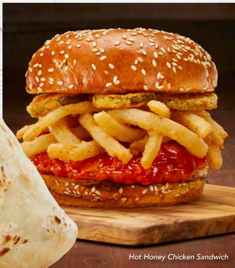
Hot Honey Chicken Sandwich