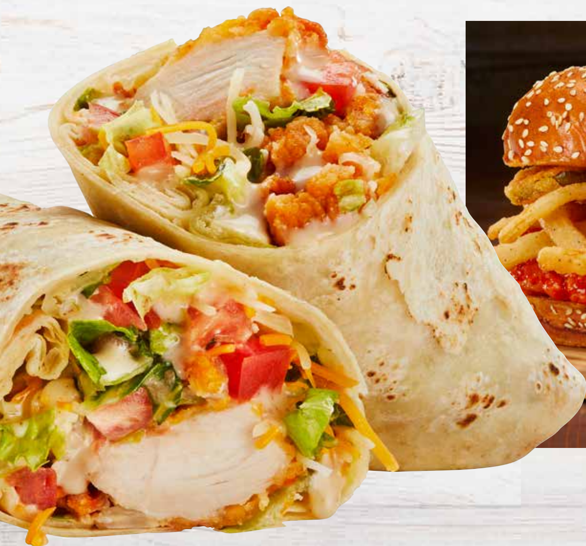
Honey Dijon Chicken Wrap