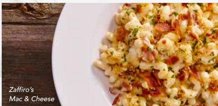
Zaffiro's Mac & Cheese

Add fire-braised chicken breast 4.00 | 215 cal